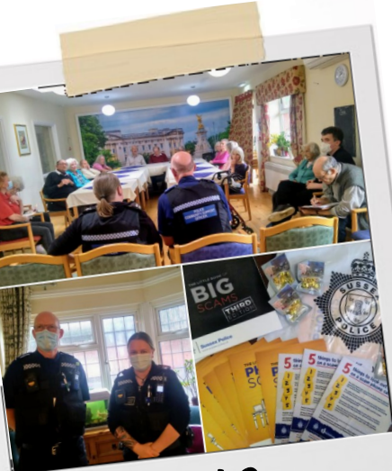
DAY 2 Police pop in and say hi