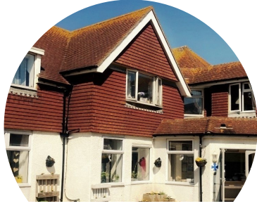
FRESHFORD COTTAGE NURSING HOME