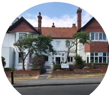
HIGHBURY HOUSE NURSING HOME